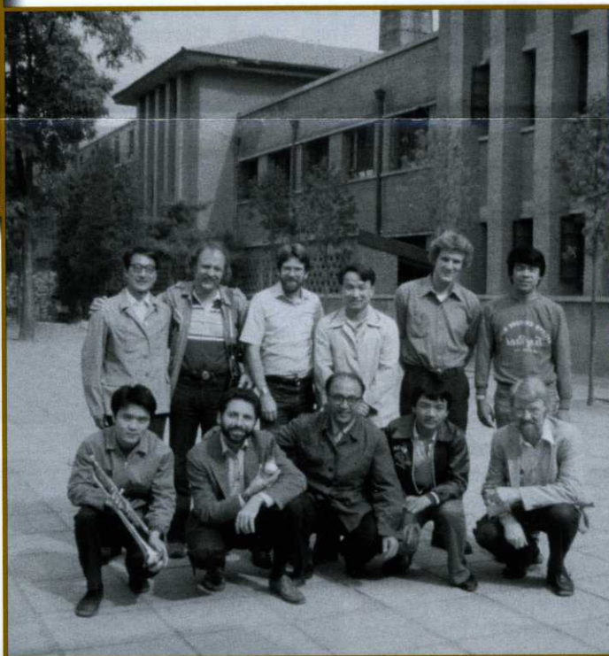
ABQ and faculty of the Beijing Conservatory on ABQ's first tour of China in 1982 marking the first American brass ensemble to perform in China.