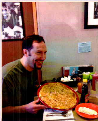
The author in a lighter moment of contemplation on tour in Greenville, PA.

In our culture of sports heroes and worshipping those who've "made it", it's easy to get caught up in the mindset that you're either a success or a failure. I distinctly remember an argument with a college girlfriend who dared to suggest that perhaps I would never get that